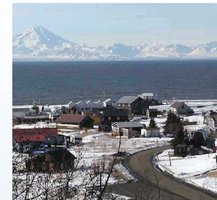
Ninilchik, Kenai Peninsula Borough

Or P.O. Box 110809 Juneau, Alaska 99811-0809 (907) 465-4750