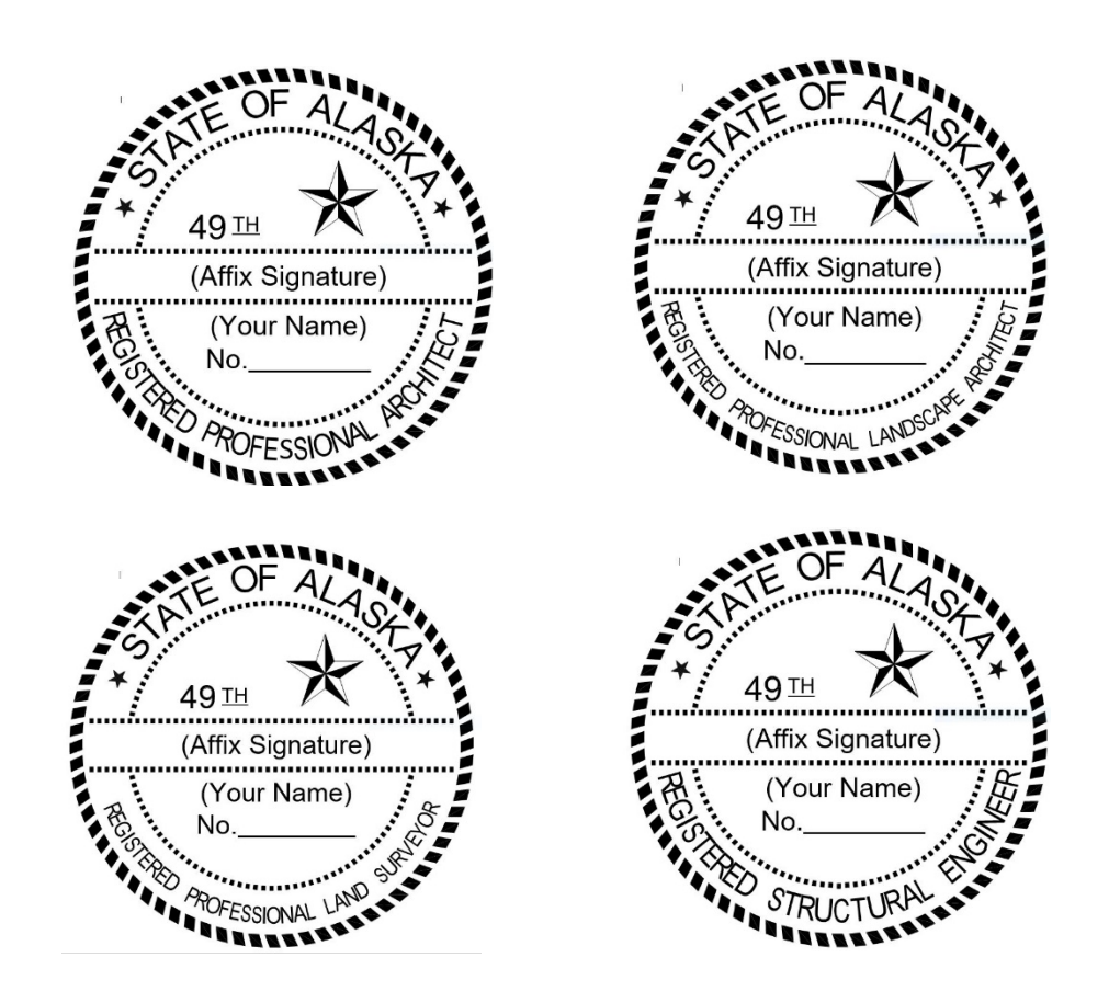
(b) The seal authorized for use by professional engineers shall be of the following design or a substantially similar electronic or digital representation of the design:

12 AAC 36.180. SEAL. (a) The seal authorized for use by professional architects, <u>landscape</u> <u>architects</u>, <u>land surveyors</u>, <u>and structural engineers</u> shall be of the following <u>designs</u> [DESIGN] or a substantially similar electronic or digital representation of the <u>designs</u> [DESIGN]. <u>The license number noted on the seal shall be only the numerical characters of the</u> <u>registrant's license number (exclude alpha characters)</u>.