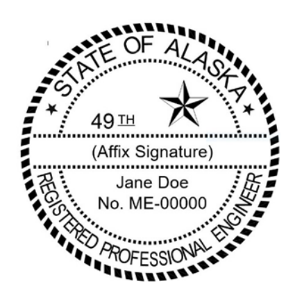
Example Professional Engineer Seal

The seal must reflect the branch of engineering two-character identifier (XX) authorized by the board. This identifier shall be placed before the registrant's license number as shown in the examples. The license number noted shall be only the numeric characters of the registrant's license number and exclude alpha characters.