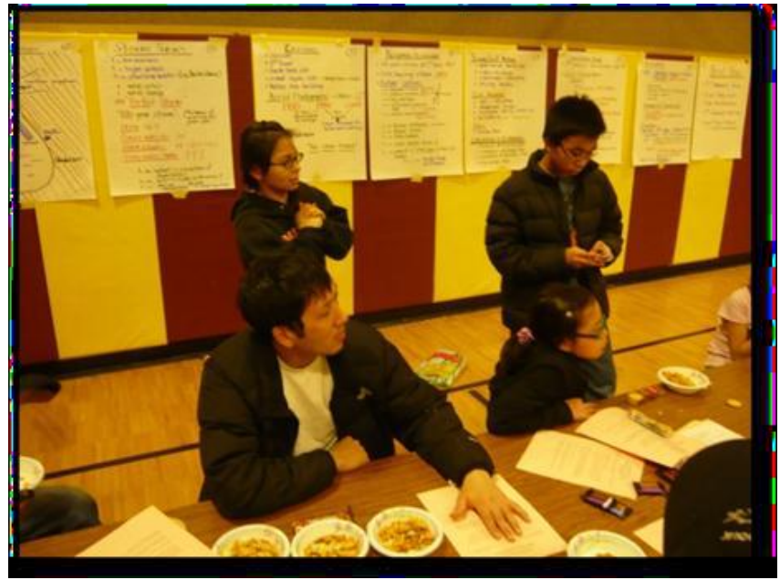
Shaktoolik adults and youth participation