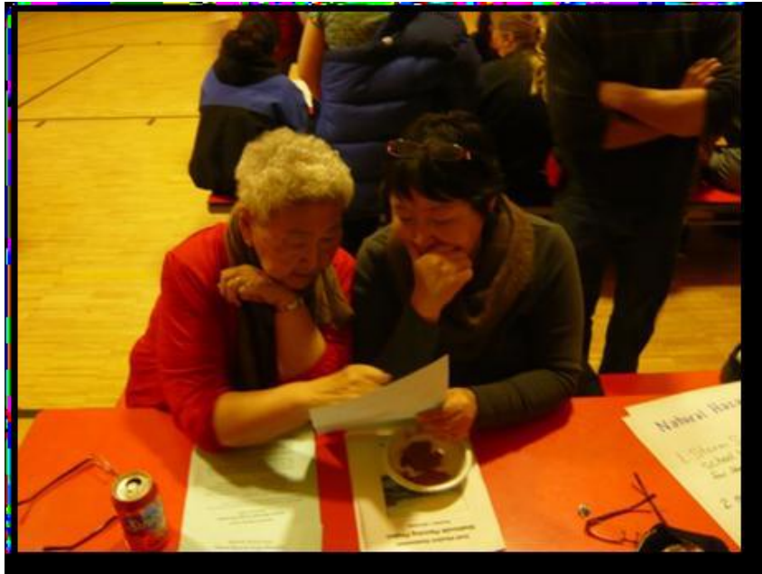
Shaktoolik Elder's input