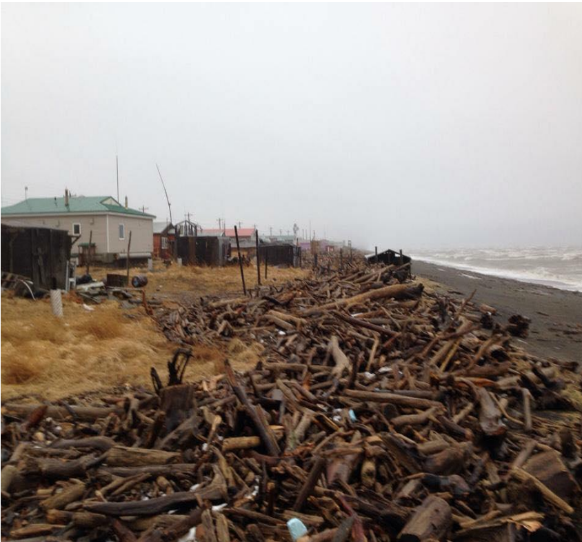
2013 Storm without slush