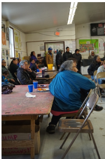
Meeting participants listen to the presentation.