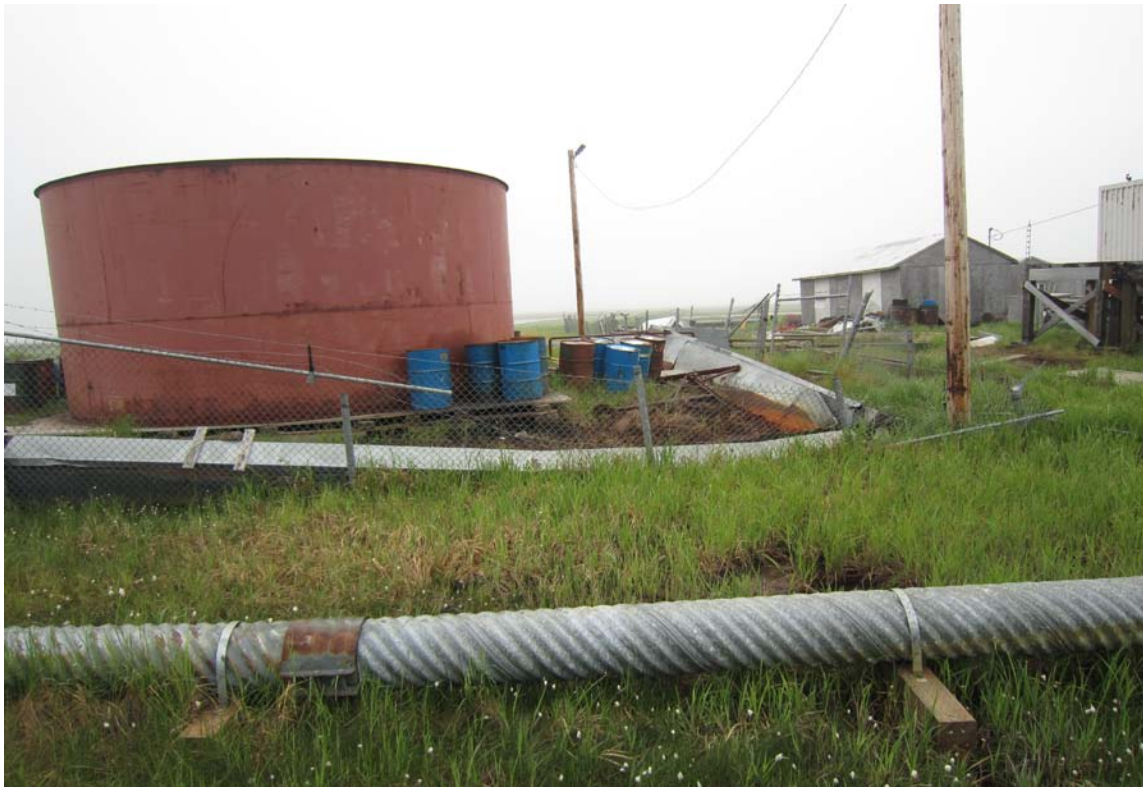
Photo 10: Tank farm, damaged fence, drum storage within containment area