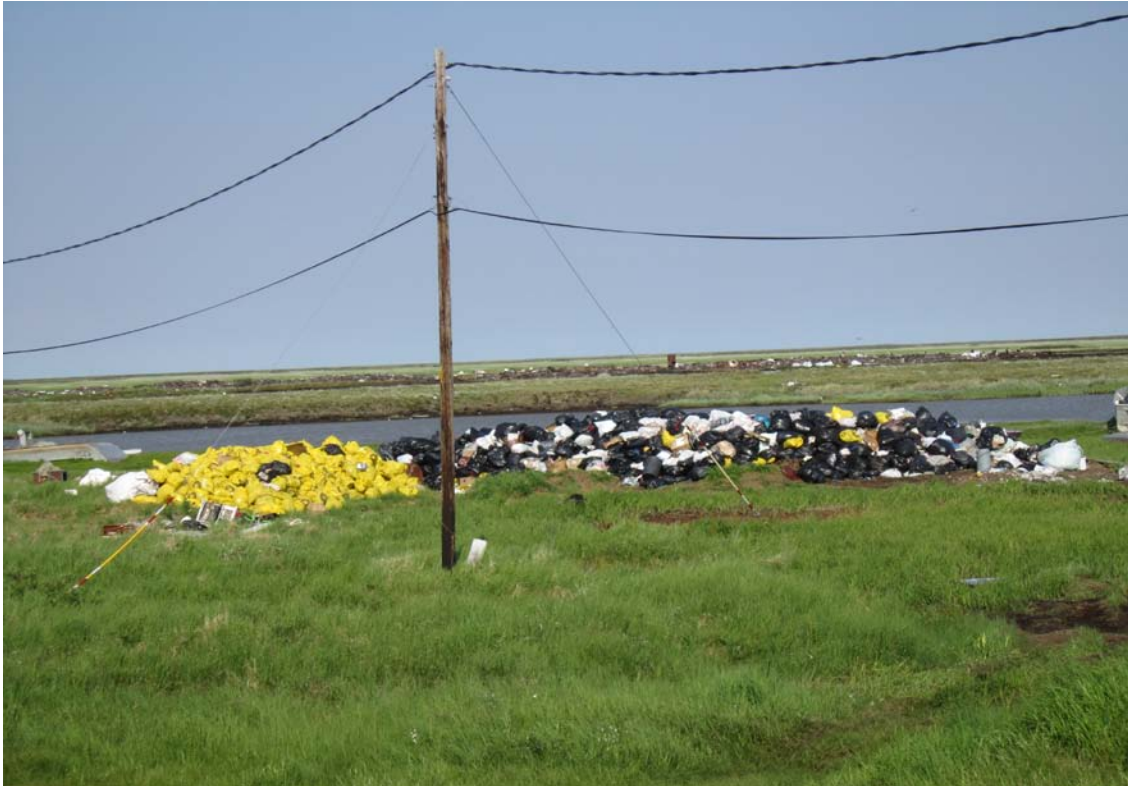
Photo 9: Bagged waste slated for transport across the river to landfill