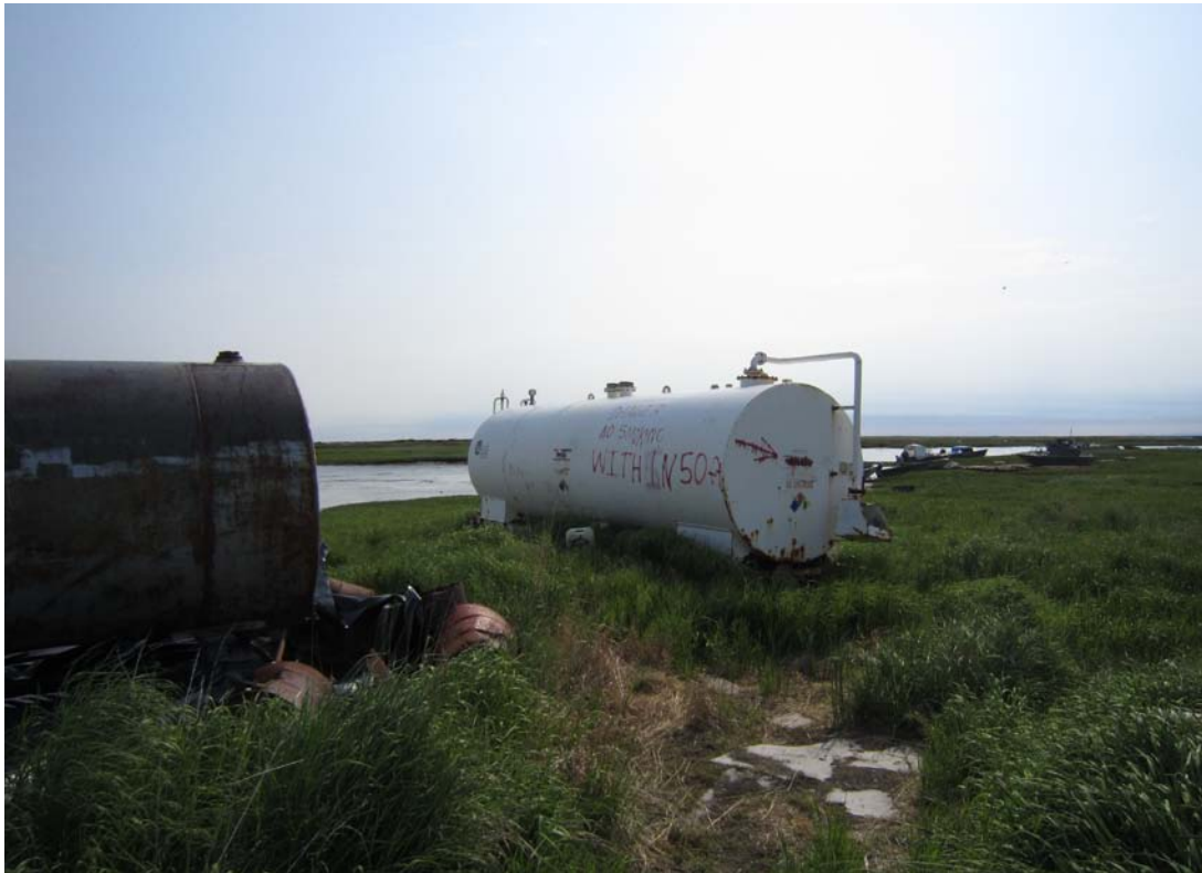
Photo 23: 10,000 gallon, double walled tank, empty and out of service