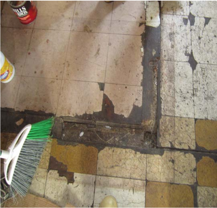
Photo 32: Flooring a mix of old and new tiles with potential for ACM.