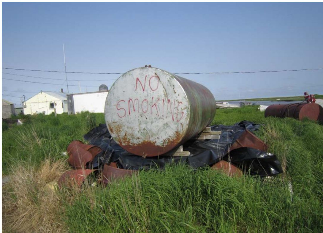
Photo 24: 3000 gallon tank, no secondary containment, empty and out of service.