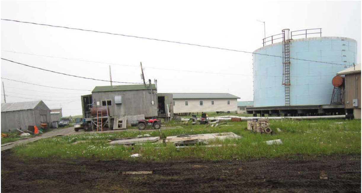
Photo 28: UPC generator building and washeteria water holding tank