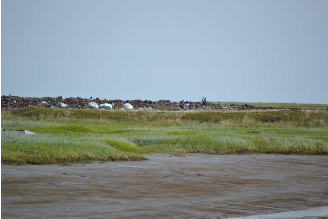
Photo 1: Looking east at landfill across Newtok River at low tide.