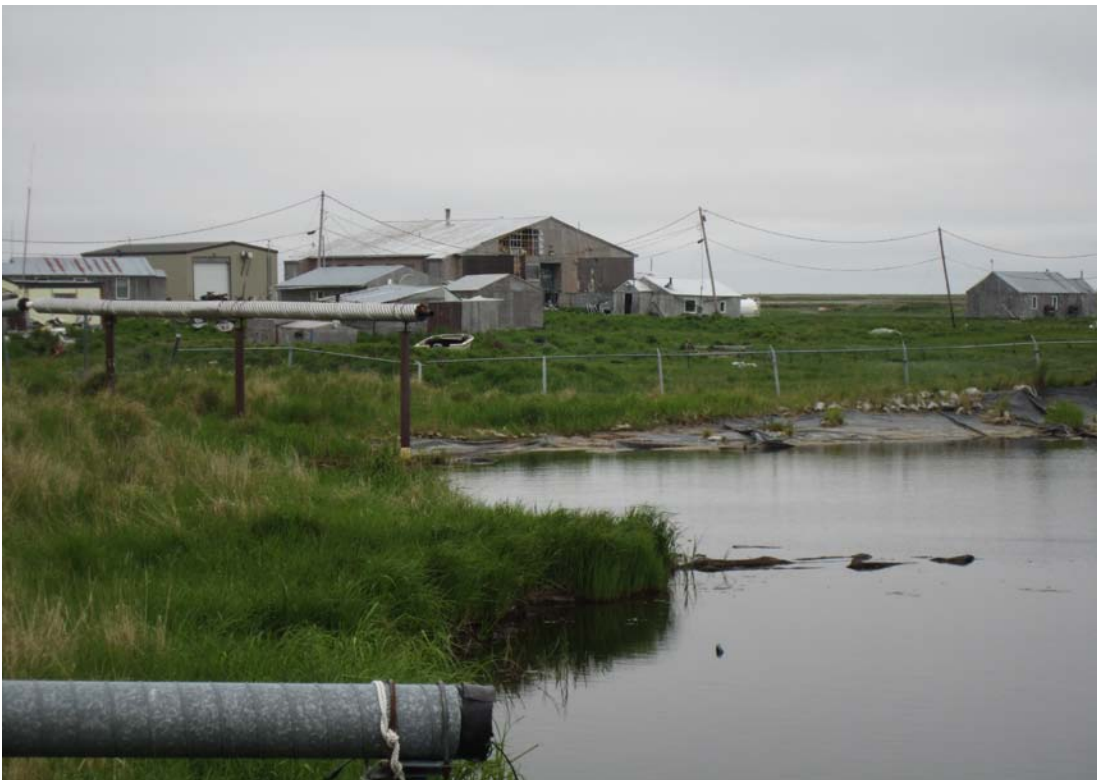
Photo 26: Piping from washeteria in the background. Piping from Newtok School in the foreground.