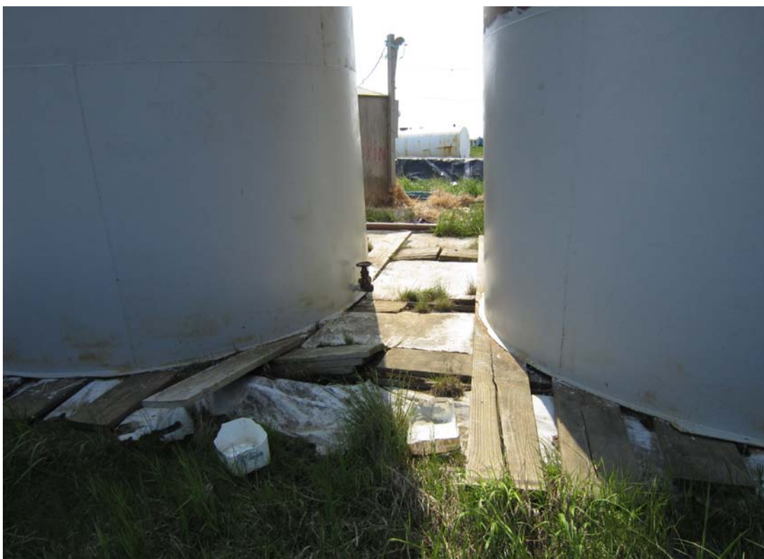
Photo 20: Inside tank farm, hydrocarbon staining below fill spouts.