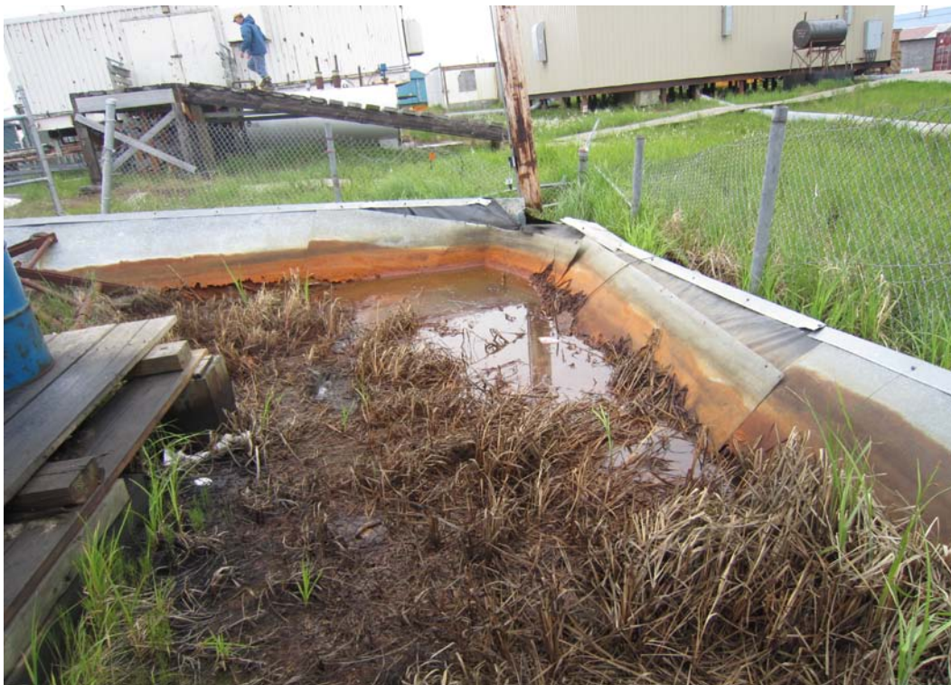
Photo 11: Hydrocarbon staining and stressed vegetation in SW corner. Containment wall in disrepair.