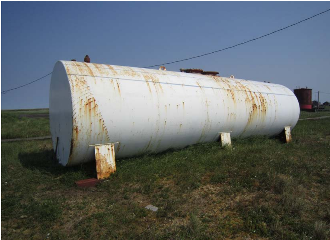
Photo 21: 10,000 gallon, double walled tank, no longer being used.