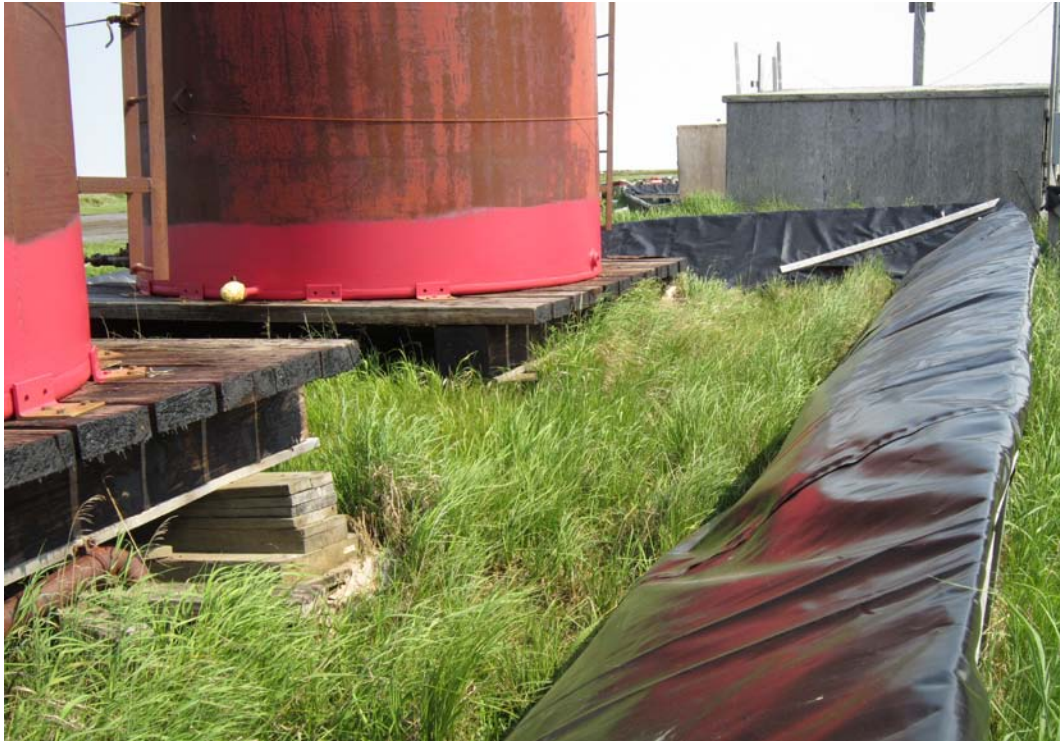
Photo 17: Creosote treated wood platforms, containment wall in good condition