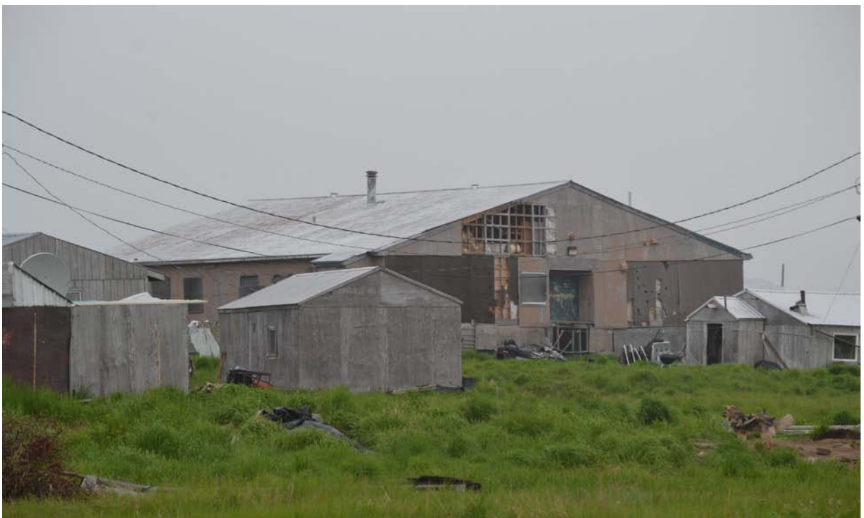
Photo 29: School built in the 1960s. Building is boarded up and no longer used.