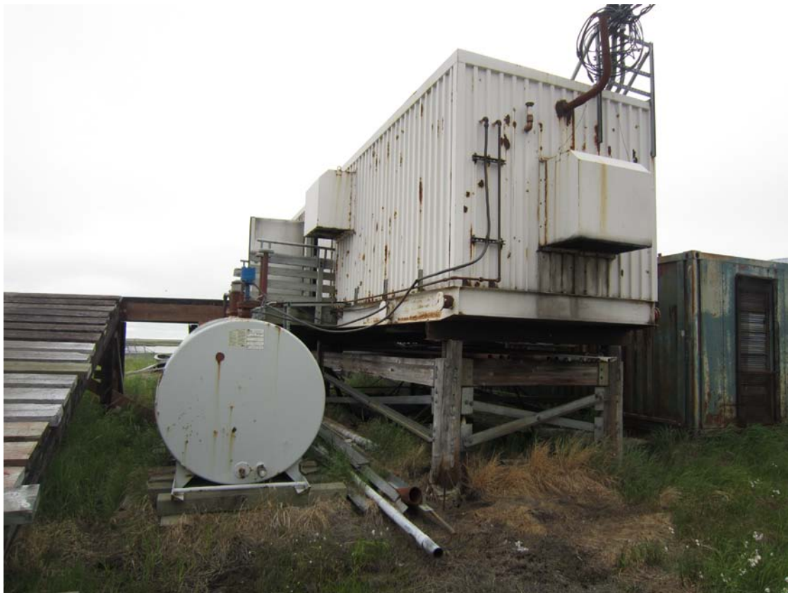
Photo 14: Stressed vegetation near power generation conex 2000 gallon tank.