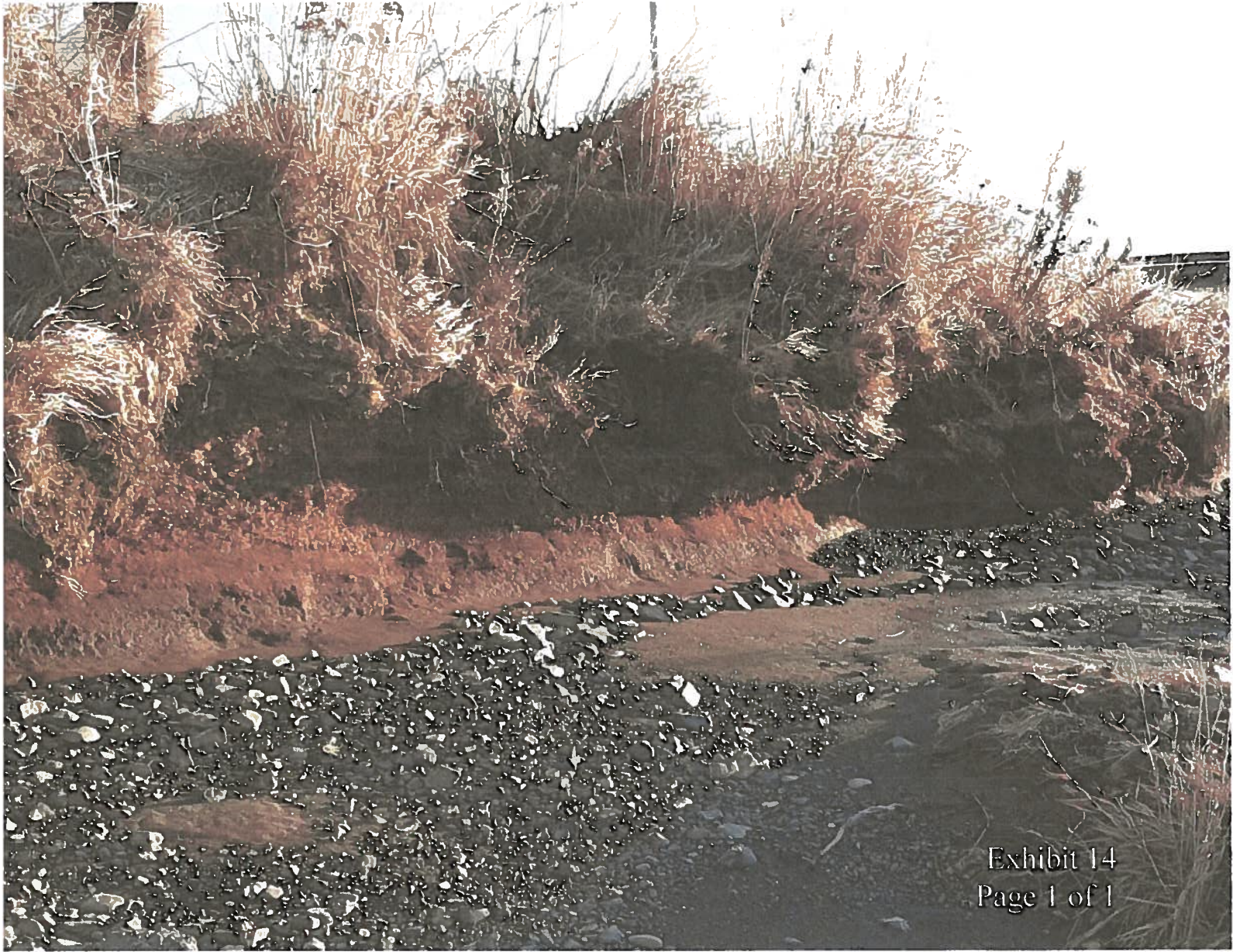
Exhibit 14 Page 1 of 1