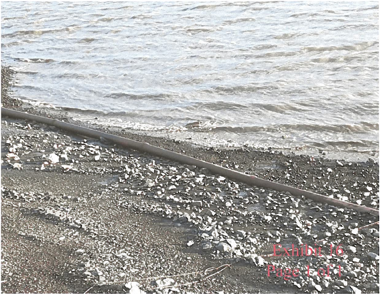
Exhibit 16 Page 1 of 1