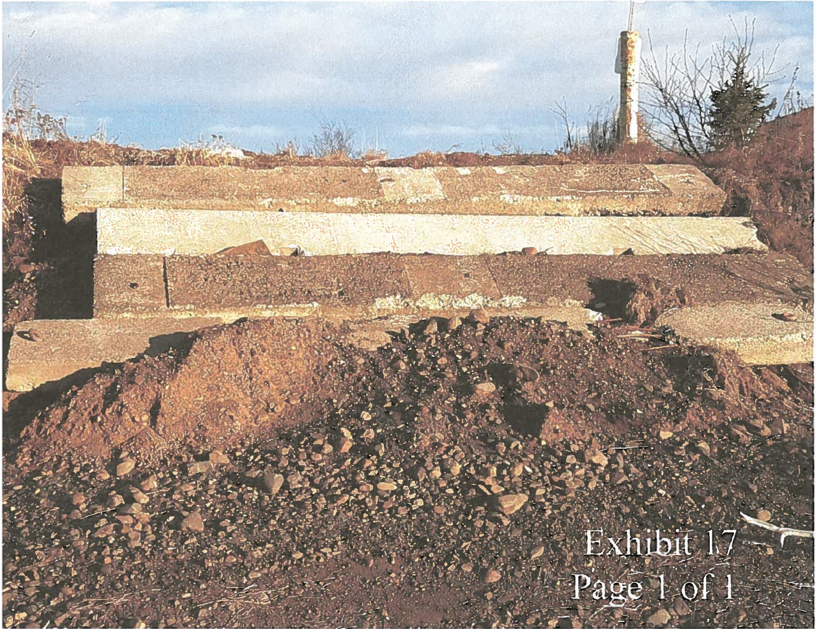
Exhibit 17 Page 1 of 1