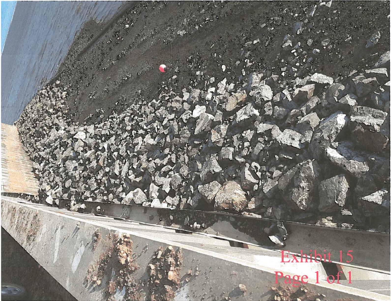
Exhibit 15 Page 1 of 1