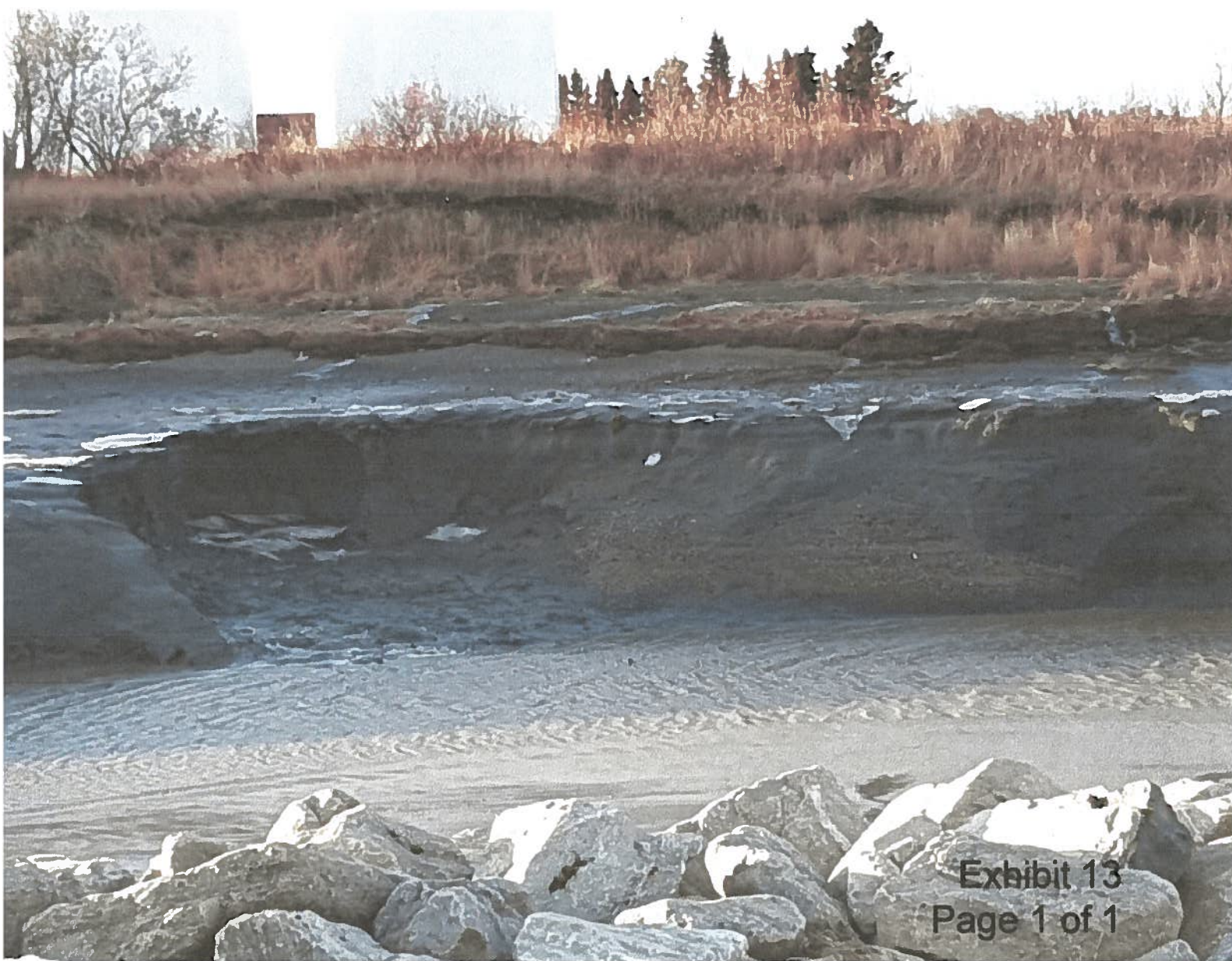
Exhibit 13 Page 1 of 1