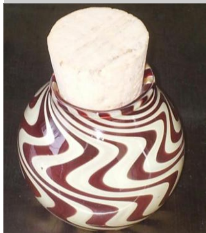
Permit# 7100 Archart's Glass Emporium