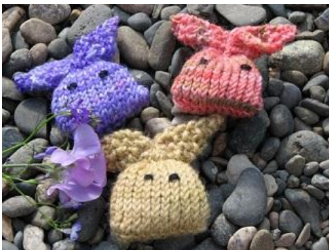
The Black Sheep Cottage

Topher Maguire Seward 331-8262 Permit #7090 Mobile application development Permit #7091 Website development mobilebusinessapps@icloud.com www.mobilizealaska.com Wholesale: NO