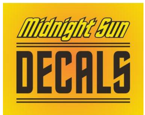
Midnight Sun Decals

Tom Zaruba Juneau 789-9164 Permit #7102 USA and Canadian patented automatic rope and cable coiling machines for the commercial and sport fishing industries. shanghai@gci.net extradeckhand.com Wholesale: YES