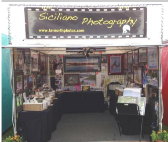
Permit# 5893 - Siciliano Photography at the Alaska State Fair