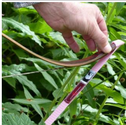
Permit# 7118 Arjuna Archery