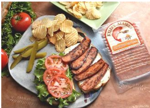
Tustumena Smoke House

Charles Sather Eagle River 694-4724 Permit #7120 Alaskan made BBQ sauce csather@gci.net Wholesale: YES