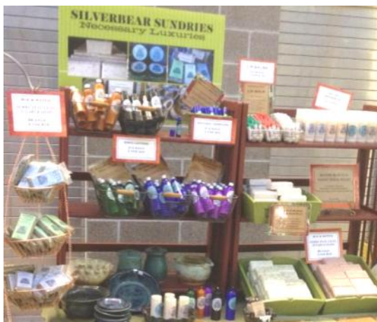
Permit# 6393 - Silverbear Sundries at the Christmas Towne Bazaar