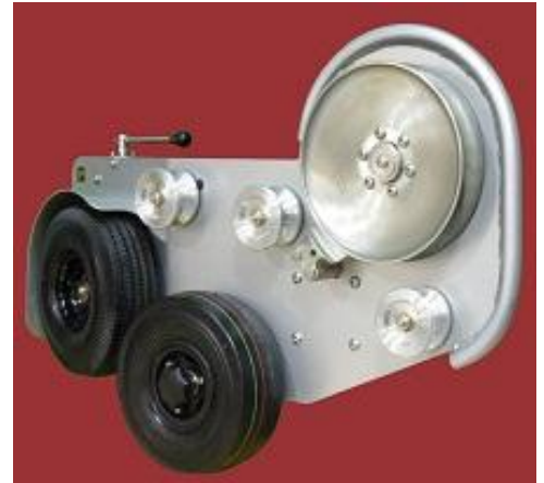
The Extra Deckhand

Erika Everding Wasilla 357-3435 Permit #7101 One-of-a-kind creations from the forests of Alaska. Handcrafted bowls, platters, and mushrooms harvested from nonliving Birch, Spruce and Cottonwood trees. Each piece has a hand-rubbed, food-safe finish. everding@mtaonline.net Wholesale: YES