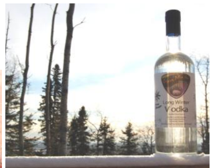
Ursa Major Distilling

Fred West Soldotna 260-3401 Permit #7117 Kylee's Alaska smoked salmon bacon, Alaska salmon chorizo sausage, Alaska salmon pepperoni, Alaska salmon jerky, organic ingredients and no preservatives. tustumenasmokehouse@alaska.net www.fredssmokedsalmon.com Wholesale: YES