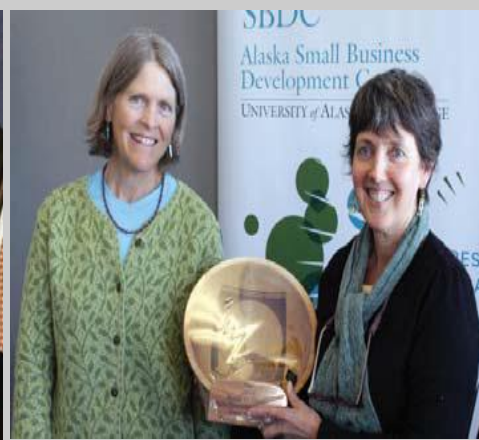
(2012) Denali Dreams Soap

Since 1992, one MIA permit holder is selected annually to receive this prestigious Made in Alaska “Manufacturer of the Year” award. This award is designed to celebrate and recognize the outstanding achievements of one MIA permit holder who has demonstrated an ability to overcome obstacles and thrive while contributing to Alaska’s economy. Nominations are now being accepted for the 2013 Manufacturer of the Year.