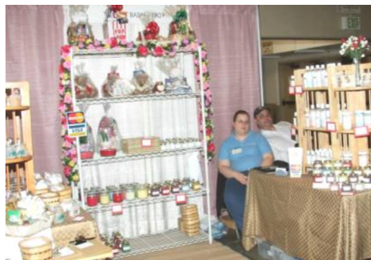
Permit# 5307 - The Gift Basket Lady at the Alaska Women's Show