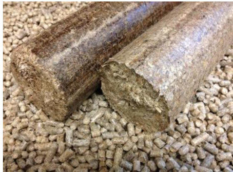
Superior Pellet Fuels, LLC

Mariana Carter Coffman Cove 329-2923 Permit #7113 We manufacture red cedar blocks utilizing only waste raw material from local saw mills. These blocks are used in closets to prevent humidity and mold. carters@coveconnect.com Wholesale: YES