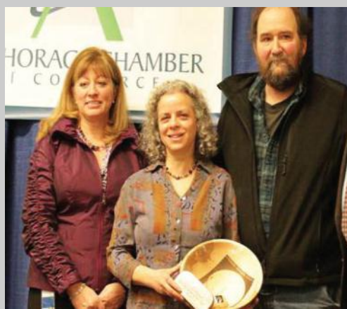
(2011) Kahiltna Birchworks