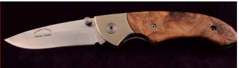
(Top) Alaska Rod's Pocket Knife (Permit# 6162) (Left) J.E. Carlson's Bottle Opener (Permit# 5640)

Both images were captured at the 2013 MIA Photography Workshop in Haines.