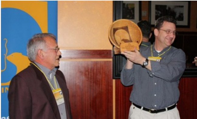
2009 Manufacturer of the Year is Insulfoam

Judges will consider the nominee's originality, challenges met, employment practices/job creation, time in business and in Made In Alaska program and community involvement. Award will be made at a public meeting in recipients' home city if possible.