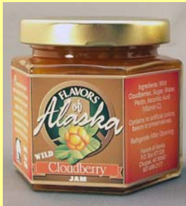
Permit #5081 Flavors of Alaska