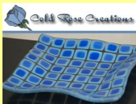
Permit: 6100 Cold Rose Creations