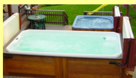
Permit: 3617 Alaska Pools and Spas