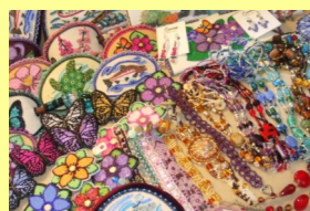
Permit: 6367 The Little Willow