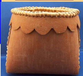
Little Su Rocks