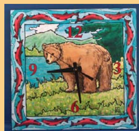
Fiery Arts Studio

Suggestions for next year’s workshops are most welcome. Contact Bill Webb at 272-5634 or email bill@anchoragemarkets.com .