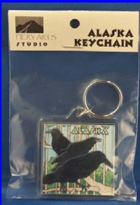
Fiery Art Studio