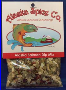
Alaska Spice Company