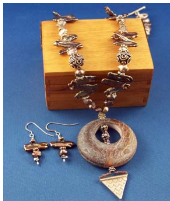
Denise Brown Jewelry