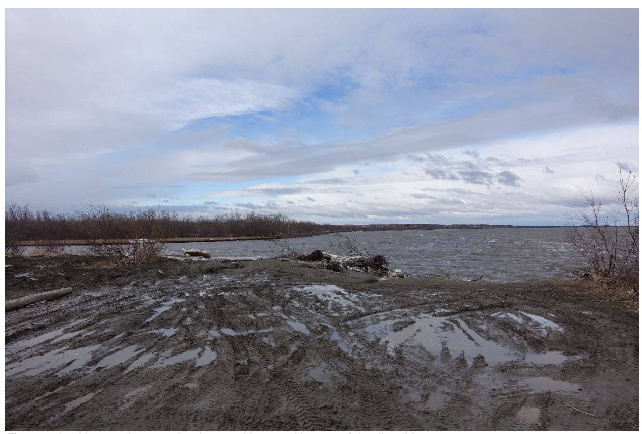
Figure 9. Looking southeast at the damaged boat and hovercraft landing. May 11, 2018