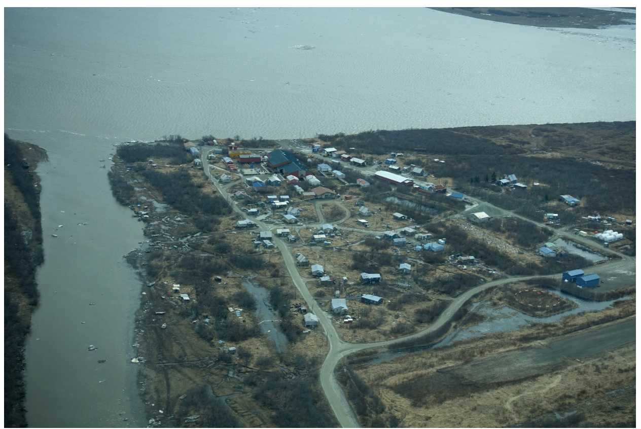
Figure 1. Looking east at part of Napakiak, May 10, 2018. Rapid erosion threatens the entire community.

Max Neale, MS Environmentally Threatened Communities Program Alaska Native Tribal Health Consortium 4500 Diplomacy Drive Anchorage, AK 99508 907-729-4521 mdneale@anthc.org