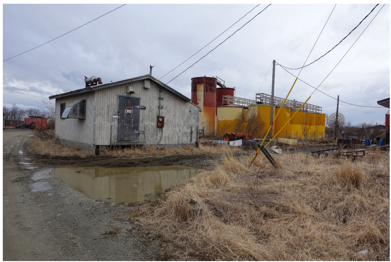
Figure 6. LKSD fuel electric power infrastructure. May 11, 2018