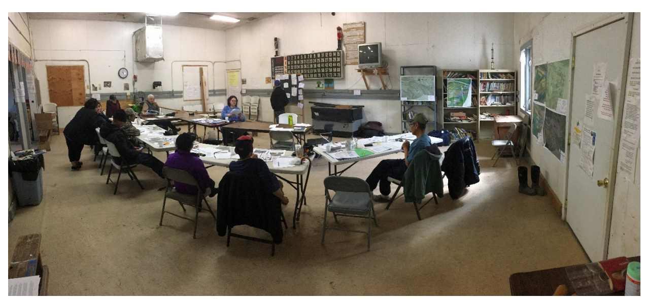
Figure 11. Planning Meetings in Bingo Hall.