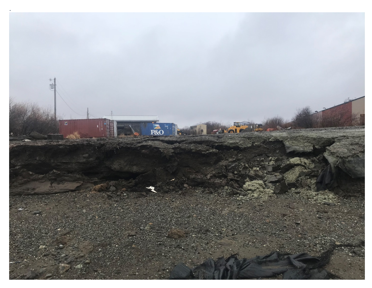
Figure 3. May 13, 2018 storm damage. Note the close proximity to the Napakiak school (right).