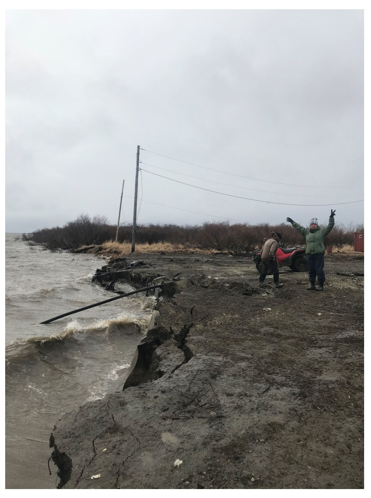
Figure 4. Erosion during May 12-13, 2018 storm event. Taken May 13, 2018.