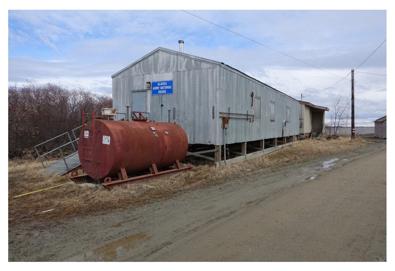
Figure 7. Armory buildings on May 11, 2018. Note the Kuskokwim river in the background.