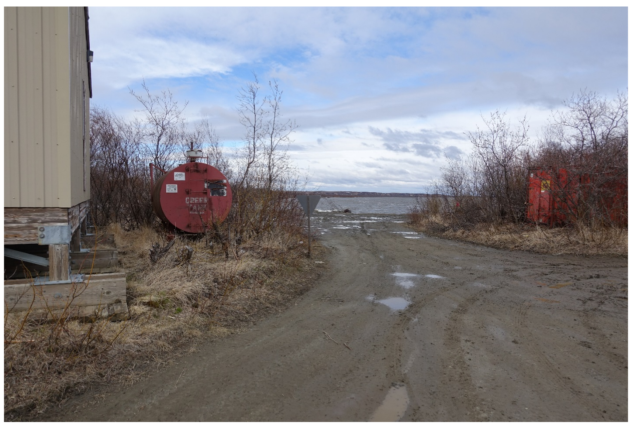
Figure 8. Armory building and road leading to boat and hovercraft landing area. May 11, 2018