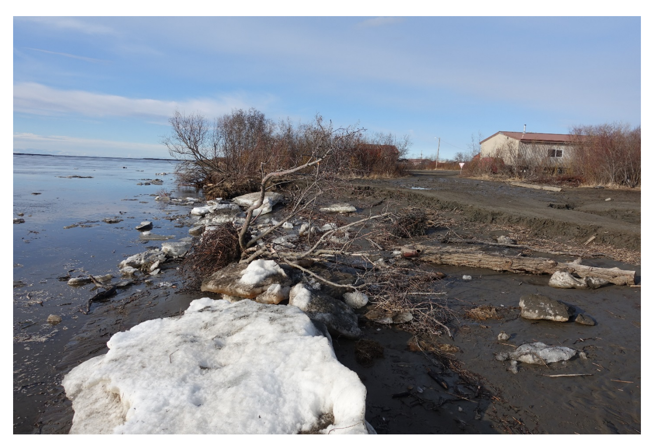
Figure 10. Looking west at the damaged boat and hovercraft landing