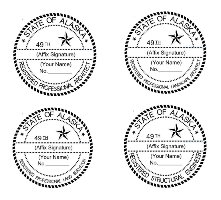
(b) The seal authorized for use by professional engineers -shall be of the following design or a substantially similar electronic or digital representation of the design:

12 AAC 36.180. SEAL. (a) The seal authorized for use by professional <u>a</u>Architects, <u> H andscape</u> <u>aArchitects</u>, <u> H and <u>sSurveyors</u>, <u>and <u>sStructural eEngineers</u></u> shall be of the following <u>designs</u> [<u>DESIGN</u>] or a substantially similar electronic or digital representation of the <u>designs</u> [<u>DESIGN</u>]. <u>The license number noted on the seal shall be only the numerical characters of the</u> <u>registrant's license number (exclude alpha characters)</u>.</u>