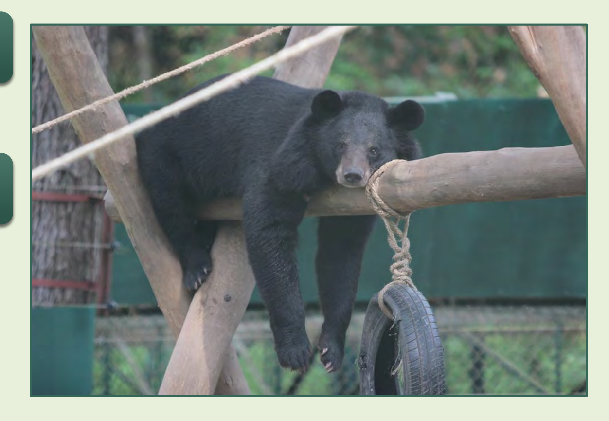
Take a quick nap, you're not done yet