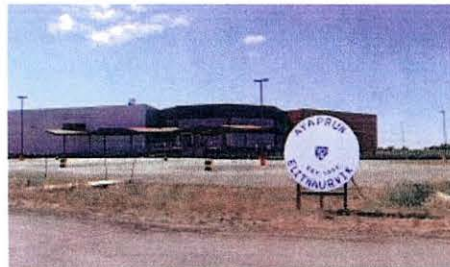
A new sign will greet Ayaprun Elitnaurvik students when they arrive to their temporary school location at the Kipusvik building.

Dear KLA and Ayaprun Parents, On Friday and Saturday, June 10 and 11, the LKSD Board met in regular session. The Board received an update on the status of the Kilbuck fire and had discussions on next steps for the reconstruction of the Ayaprun and KLA schools. After serious consideration, the Board felt it was in the best interest of the district to pursue rebuilding on the old Kilbuck site.