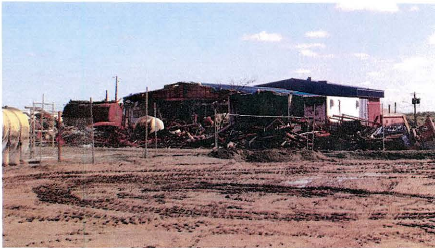
LKSD workers are preparing the Kilbuck fire debris for cleanup.