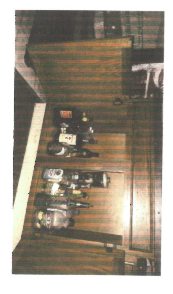
Gold Miners Lodge Restaurant & Motel LLC Lic# 4380 Lic# 4526