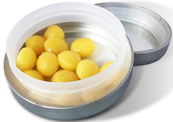
Open view (proposed product not shown here)