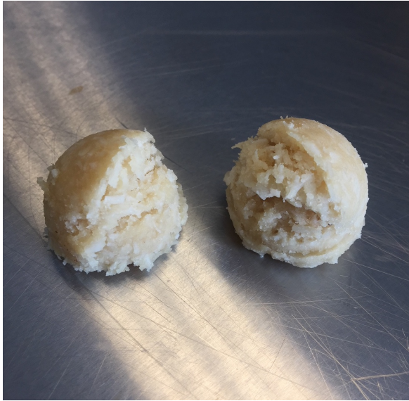
Vanilla color Cannaroon