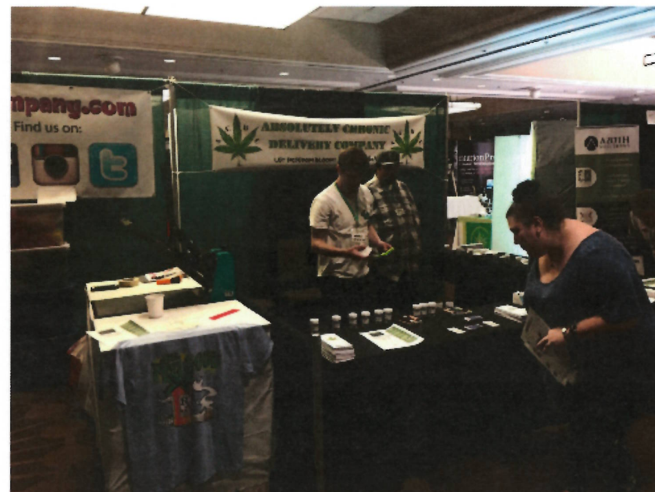
ACDC volunteer crew for public events at the THC Fair, Anchorage Alaska. July 29th 2017