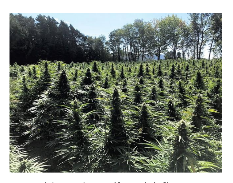
Cannabis Sativa L (female) flowers are grown for cannabinoid and other compounds. Hemp grown for flowering tops is cannabis.