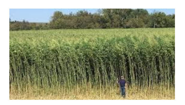
Industrial Hemp is grown for fiber, seed and stalk. Often planted close together leading to long stems for fiber decortication.