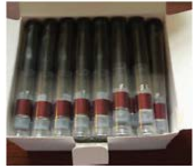
Plastic Tube Example