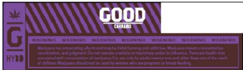
Butane Concentrate Packaging