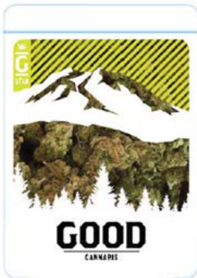
Stink Sack™ Secure bag Labels