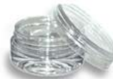
TML Acrylic Concentrate Container - Clear