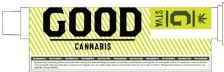
Tube Sticker Label