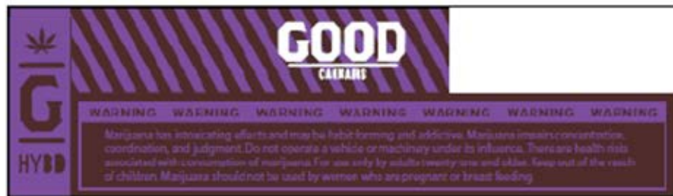
Butane Concentrate Packaging