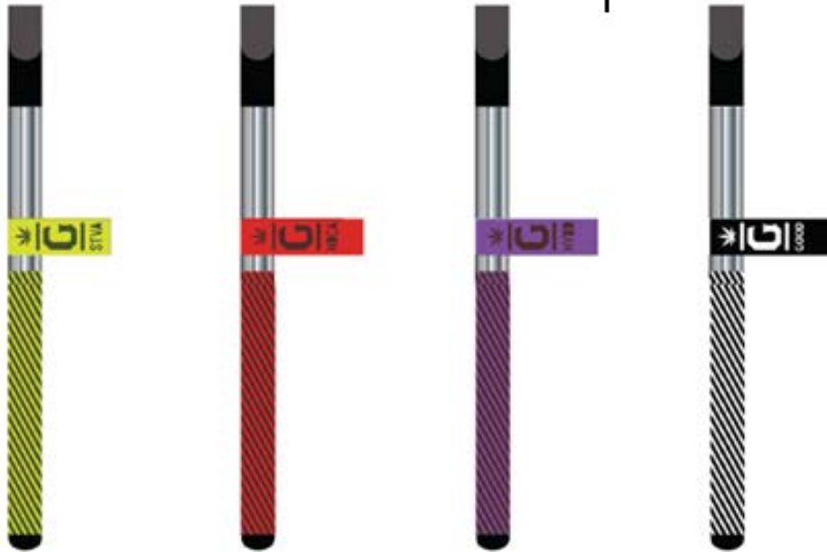
Vape Pen Labels

Alcohol and Marijuana Control Office 550 W 7 th Avenue, Suite 1600 Anchorage, AK 99501 marijuana.licensing@alaska.gov https://www.commerce.alaska.gov/web/amco Phone: 907.269.0350