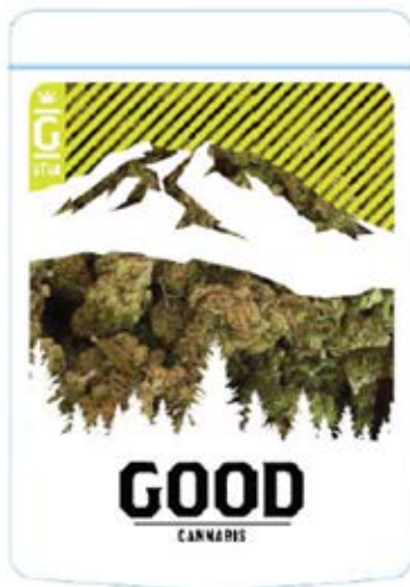
Stink Sack™ Secure bag Labels