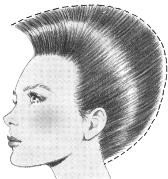
Correct Uniform Shaping

The examiners will be checking the evenness of the cutting and the blending in of the sections. Any sectioning pattern that the applicant has been taught may be used. The curling iron and blow dryer will be used on your model. Protection of model, heat, direction of movement of hair, brush or comb technique will be checked. The applicant should know three different techniques for the curling iron showing on-base, off-base, and spiral curls.