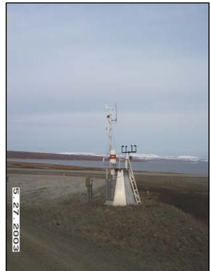
Figure 28: Golovin airport weather station