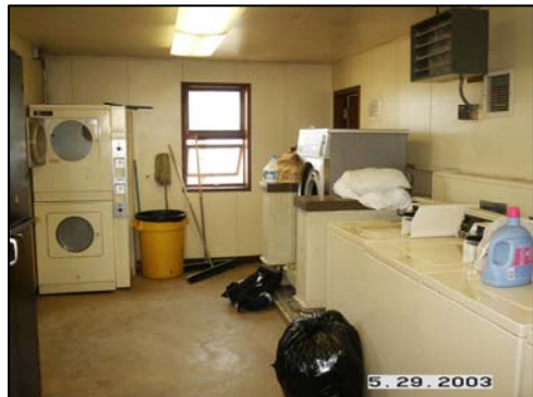
Figure 11: Washeteria interior