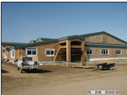
Figure 25: New Golovin School under construction