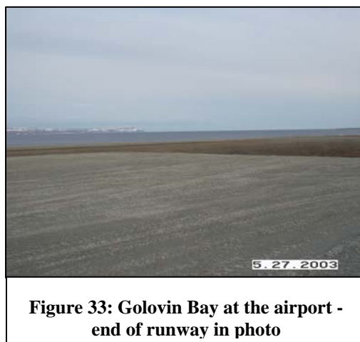
Figure 33: Golovin Bay at the airport - end of runway in photo