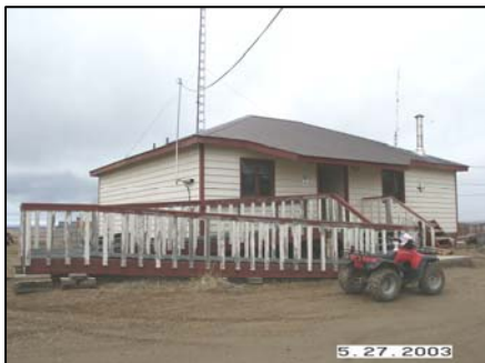
Figure 19: Golovin Health Clinic building

Golovin Health Board – oversee new clinic (new and still forming)