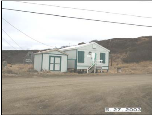
Figure 15: Golovin Tel Alaska building

Utilities (continued): Telephone Service – Tel Alaska. Cable Provider – Golovin Native Corporation. Long-distance telephone and Internet – GCI.