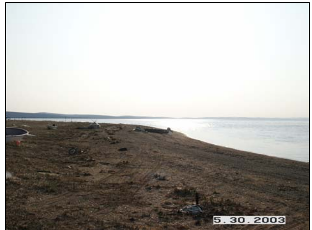
Figure 2: Beach - Golovnin Lagoon