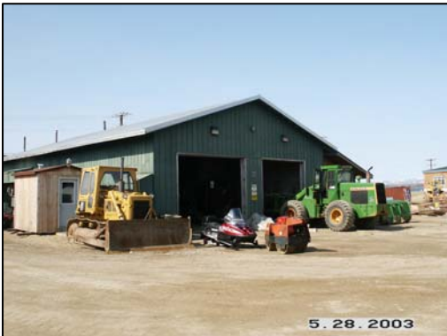
Figure 10: City of Golovin shop and Power Utility plant

Utilities - Electricity is provided by Golovin Power Utilities. Water System Operator – City of Golovin. Washeteria Operator – City of Golovin.