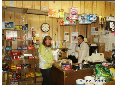
Figure 21: Chinik store interior

CDQ Group - Norton Sound Econ. Dev. Corp., 601 W. 5th Ave., Suite 415, Anchorage, AK 99503, Phone 907-274-2248, Fax 907-274-2249, web: http://www.nsedc.com