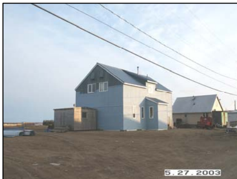
Figure 6: Golovin Covenant Church