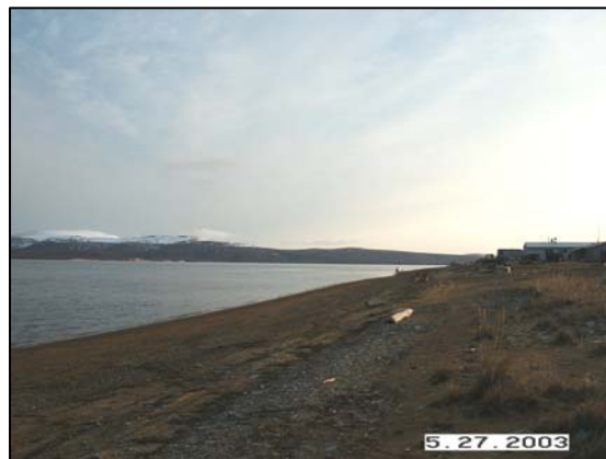
Figure 31: Golovin Bay and coast