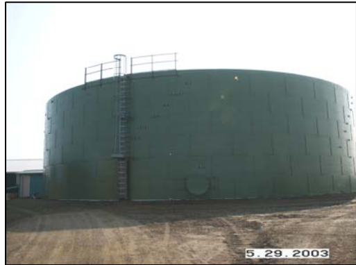
Figure 9: Golovin community water tank