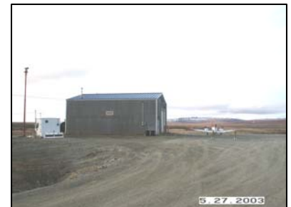
Figure 4: New Golovin airport and hangar

The City is beginning development of a community-wide piped water and sewer system. Water is pumped from Chinik Creek, treated