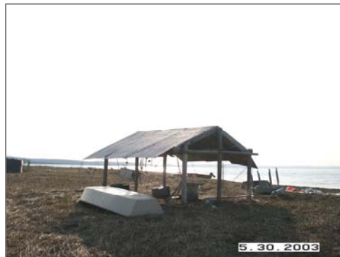
Figure 23: Fish rack on beach - Golovin is a member community to NSEDC

CDQ Group - Norton Sound Econ. Dev. Corp., 601 W. 5th Ave., Suite 415, Anchorage, AK 99503, Phone 907-274-2248, Fax 907-274-2249, web: http://www.nsedc.com