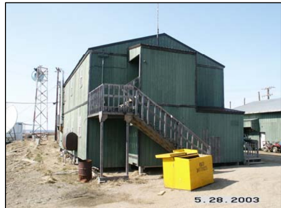
Figure 5: City of Golovin building including the City, Corporation and Chinik offices and bingo hall