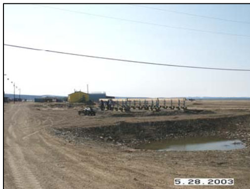
Figure 13: New washeteria site under construction