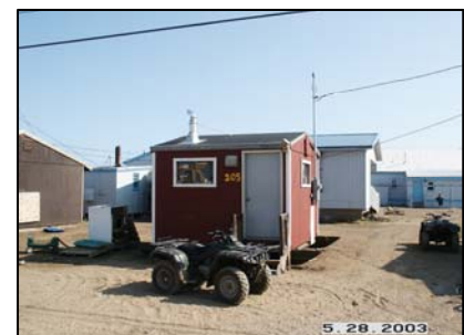
Figure 32: Golovin City building utilized for Kawerak office space - example of limited local office space