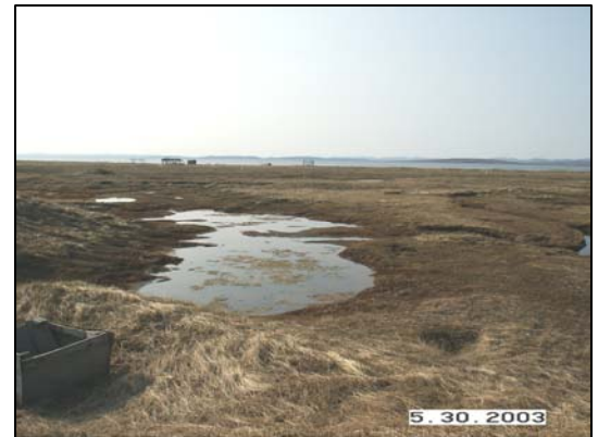
Figure 27: Example of Golovin erosion