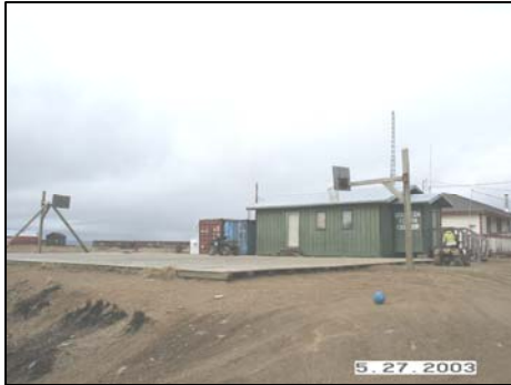
Figure 22: Chinik store building

Golovin Elders Committee – under Chinik Eskimo Community