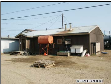
Figure 12: Golovin Washeteria facility