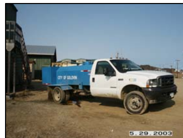
Figure 24: New Golovin water truck