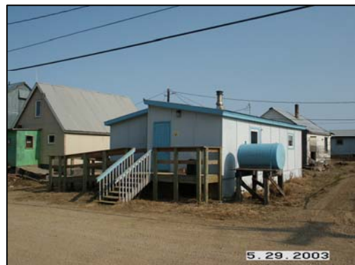
Figure 17: Golovin Head Start Building

Distance delivery post-secondary education by Northwest Campus-UAF, Pouch 400, Nome, AK 99762, Phone 907-443-2201.