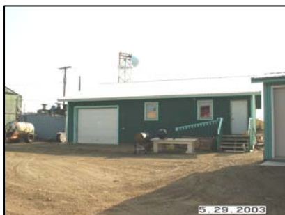
Figure 8: Golovin Fire Department Building

Public Safety – Volunteer Golovin Fire Department (fire protection and search & rescue). Kawerak Village Public Safety Officer Program. Alaska State Troopers.