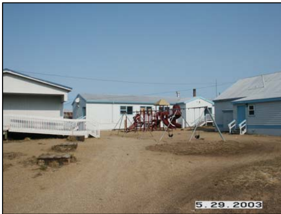
Figure 16: Golovin School buildings-campus and playground

Education - Bering Straits Schools, P.O. Box 225, Unalakleet, AK 99684, Phone 907-624-3611, Fax 907-624-3099, web: http://www.bssd.org . The school is attended by 50 students (all grades).