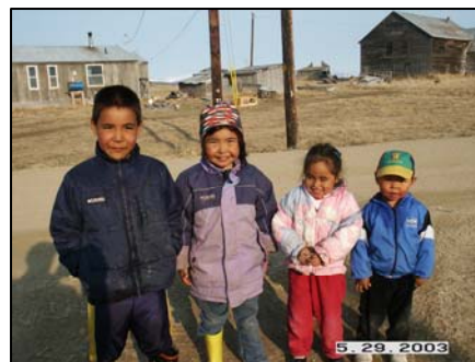
Figure 30: Golovin Children well behaved a community strength