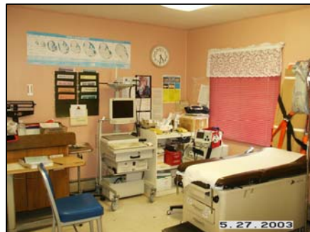
Figure 18: Golovin clinic interior