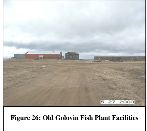
Figure 26: Old Golovin Fish Plant Facilities