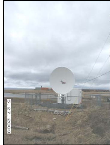
Figure 14: Golovin GCI Dish

Education - Bering Straits Schools, P.O. Box 225, Unalakleet, AK 99684, Phone 907-624-3611, Fax 907-624-3099, web: http://www.bssd.org . The school is attended by 50 students (all grades).