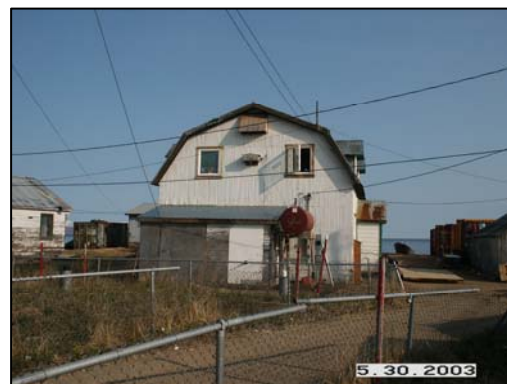
Figure 7: Golovin Old Covenant Church building